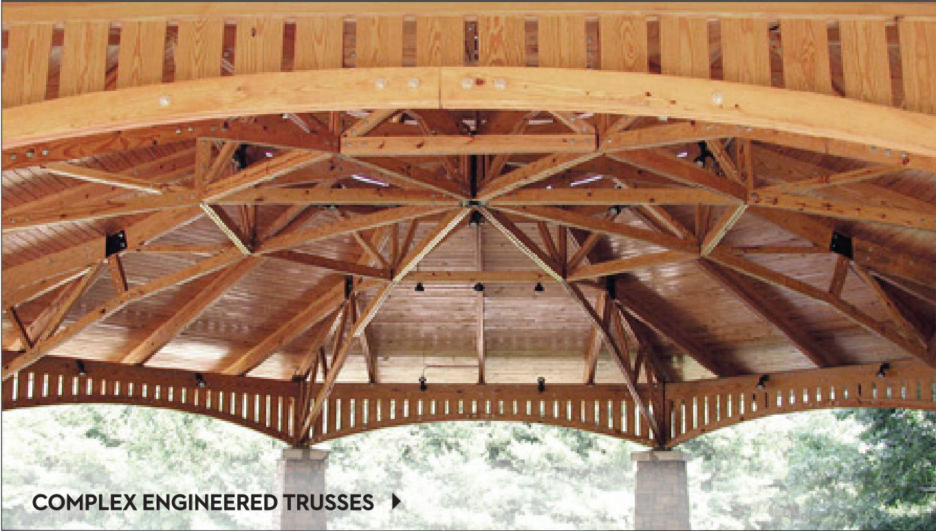
COMPLEX ENGINEERED TRUSSES ▶