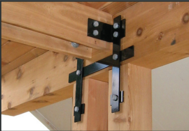
RESIDENTIAL BRACKETS, PLATES & GUSSETS ▶