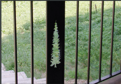
CUSTOMIZABLE RAILINGS & RAILING INSERTS ▶